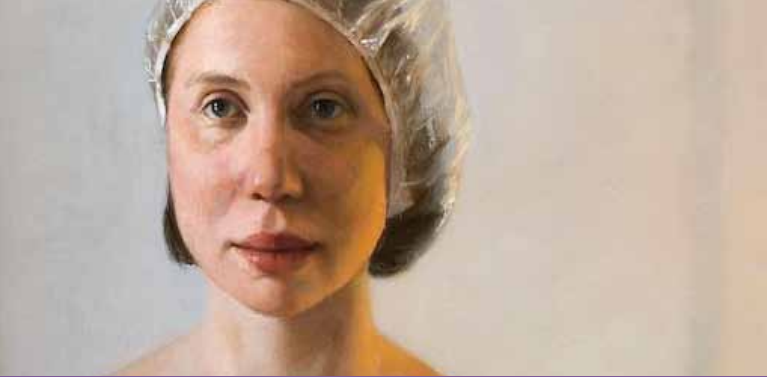
FIGURE IT OUT!

F igurative art and portraiture play a leading role in twenty-first-century contemporary art.