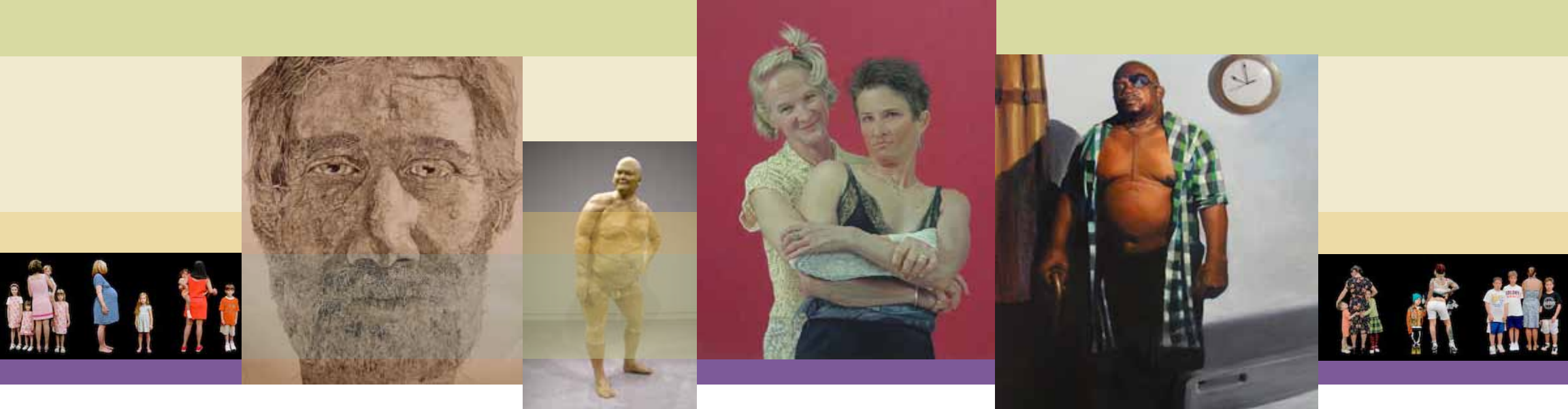
FIGURE IT OUT!

The National Portrait Gallery invites artists to figure out the contemporary art of the portrait for the Outwin Boochever Portrait Competition 2013. The competition and resulting exhibition will celebrate excellence and innovation, with a strong focus on the variety of portrait mediums used by artists today. The National Portrait Gallery welcomes single figures, groups, or self-portraits—from classical drawing and painting or hyperrealistic sculpture, to large-scale photography, to prints and new media. The competition is named for Virginia Outwin Boochever (1920–2005), a former Portrait Gallery volunteer whose generous gift has endowed this program.